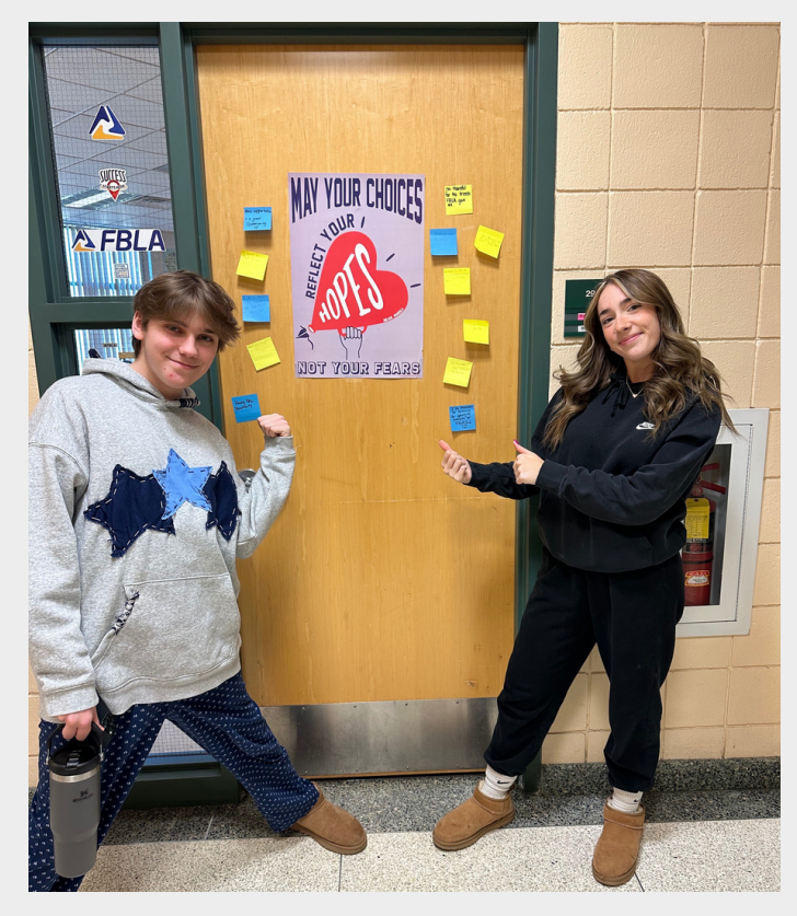
Members pose after writing notes of gratitude

The fifth day was Thankful Thursday. Outside of our advisor's room, we had post-it notes where members could share why they were thankful for FBLA and what the club has done to help them. Not only that but we once again showed our appreciation for our advisor, thanking her for all that she has done for us.