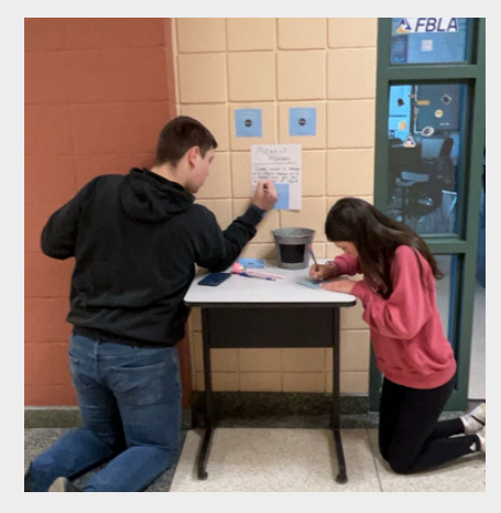
Members wrote notes for their mentors on Monday