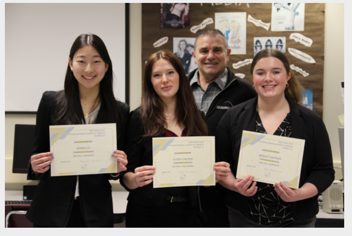
Clarence High School SDM Winners

A highlight of the event was the challenging Public Speaking Speech topic: "Based on the legal and ethical implications of cybercrime, what can be done to help combat cybercrime?" Meanwhile, participants in the Introduction to Public Speaking category tackled the question: "What skills are essential to secure your first job?"