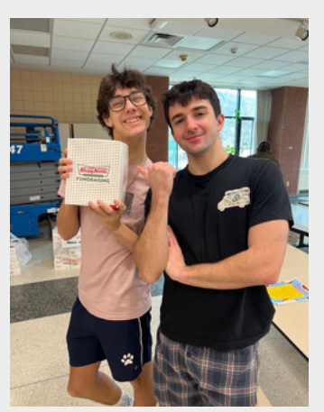
Donuts galore for the Krispy Kreme fundraiser!