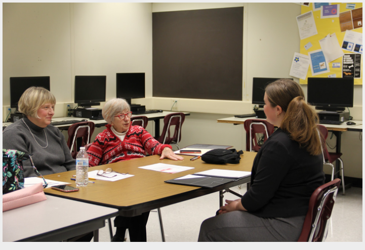
Some of the WEHS FBLA Officers

In conclusion, the Spring District Meeting was more than just a competition; it was a transformative experience for FBLA members. As participants prepare to take on the challenges of the State Leadership Conference, they carry with them the lessons, insights, and connections forged at the SDM.