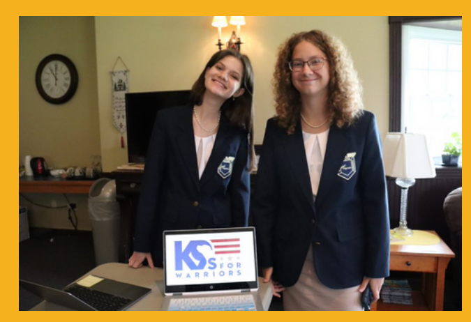
Charity proposals were given by groups of state officers before debating which would be chosen.

K9s for Warriors was founded in 2011 by the mother of a veteran suffering from PTSD, when she realized her son was only himself with his service dog.