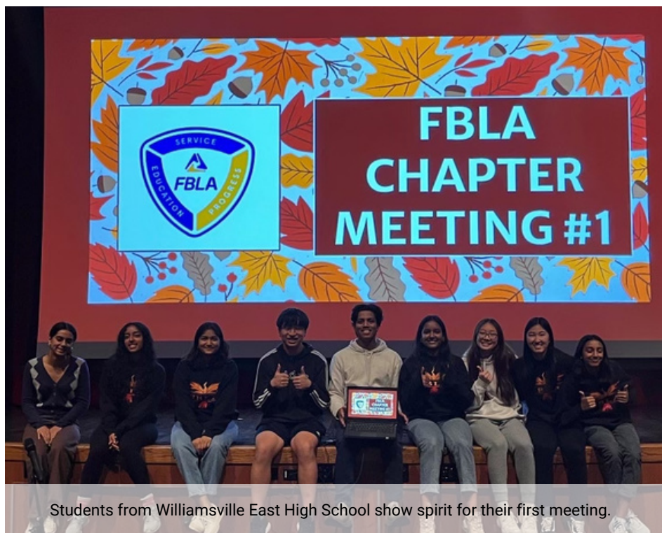
Students from Williamsville East High School show spirit for their first meeting.