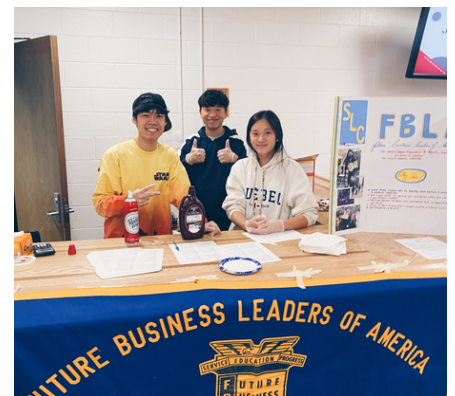
Williamsville East Students fundraise for the State Leadership Conference.

years'. There's so much to look forward to in FBLA, and we're committed to making this year's SLC a rewarding time for all.