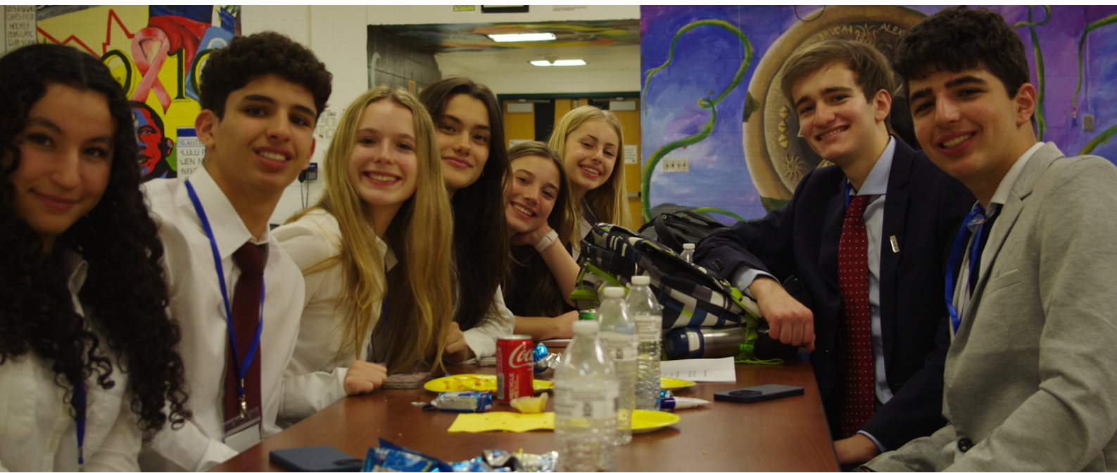
French-American School of New York students sit down post competitive event at SDM.

With both district meetings over, Mamaroneck is now looking forward to again meeting up with other local chapters from 3S and across the state at SLC. Mamaroneck has been