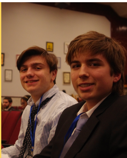
FBLA members are excited to compete at 3S SDM!

whether you are taking an objective test or competing in a presentation event be sure to practice a lot and familiarize yourself with the content. I hope that you all are getting excited for SLC, and I am excited to see you all there. It has been an honor to serve as your State President this year and it is bittersweet when I think about this year ending, but I cannot thank you all enough for this opportunity! As always, if you have any questions, comments, or concerns please feel free to reach out to me via email at president@nysfbla.org