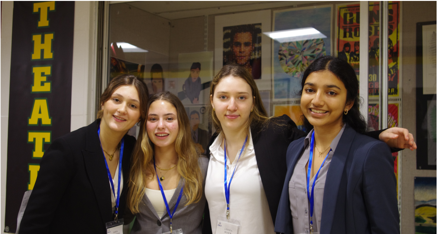
Mamaroneck High School Students await participation in their competitive events at SDM.