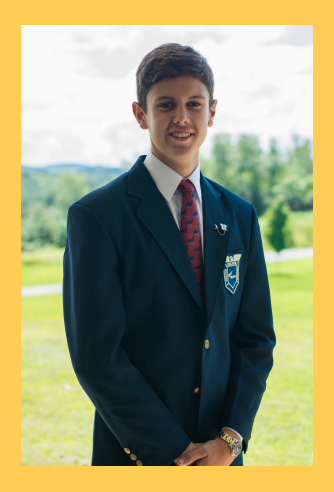
FBLA NYS Express 8